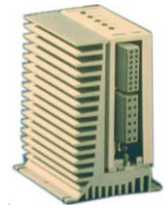
Electronic speed control