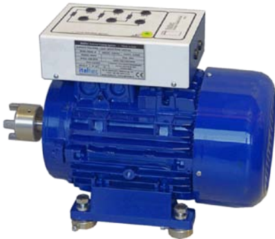
Mod.6080 3Ph Reluctance synchronized motor 2P 3kRpm Mod.6080-4 3Ph Reluctance synchronized motor 4P 1,5kRpm