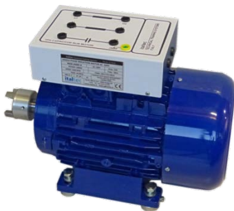
Mod.6090 Single Phase Ac Capacitor Run Motor Squirrel cage Motor Mod.6090-4 Single Phase Ac Capacitor Run Motor Squirrel cage Motor