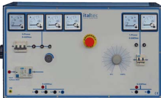
Mod.6002-08-13 3-Ph AC power supply 8+13A

3 phase adjustable output: 0÷430V, 8A with - 1 x A.C. voltmeter - 3 x A.C. ammeters