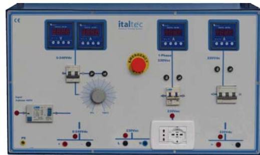
Mod.6004D -DC power supply (Digital)