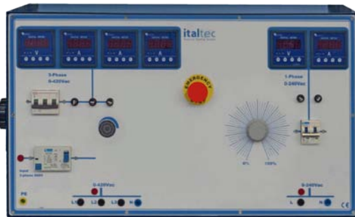
Mod.6002D 3-Ph/1Ph AC power supply(Digital)

Single phase triple output: fixed 230Vac 16A - 1 x A.C. ammeter