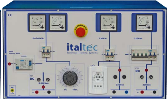
Mod.6002 3-Ph/1Ph AC power supply 8+10A