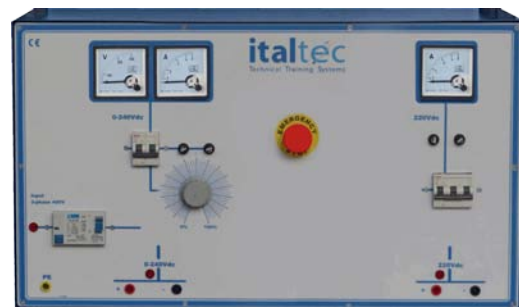
Mod.6004-03-12 -DC power supply

Single phase adjustable output: 0÷240V 13A with - 1 x A.C. voltmeter - 1 x A.C. ammeter