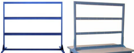
Table Top Vertical Frame