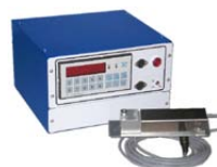
Torque meter MOD.3180C